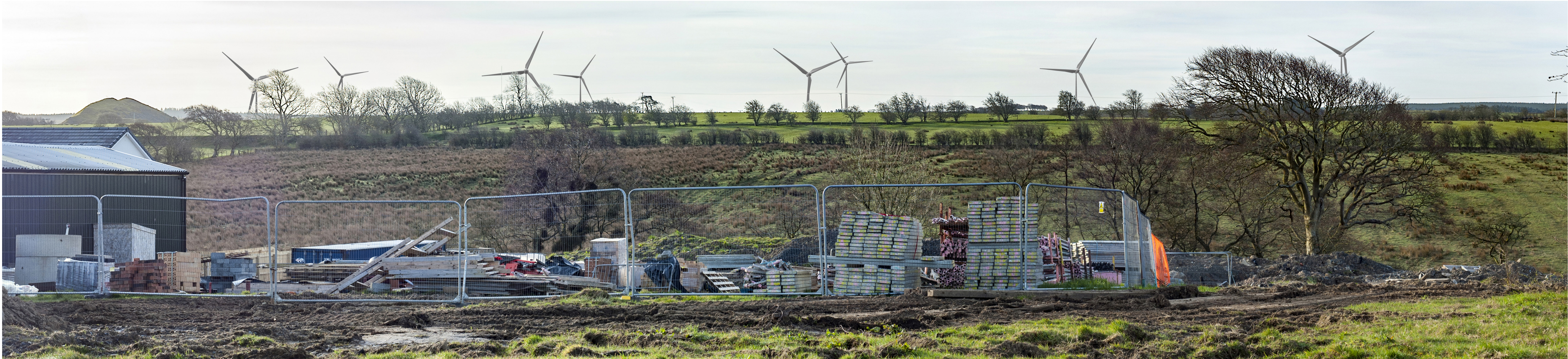
Photomontage showing consented Polquhairn Wind Farm