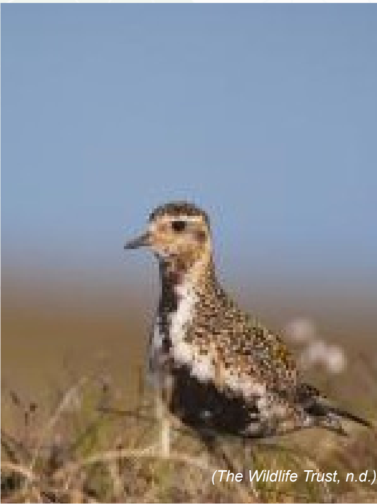
Ecological features recorded at the site