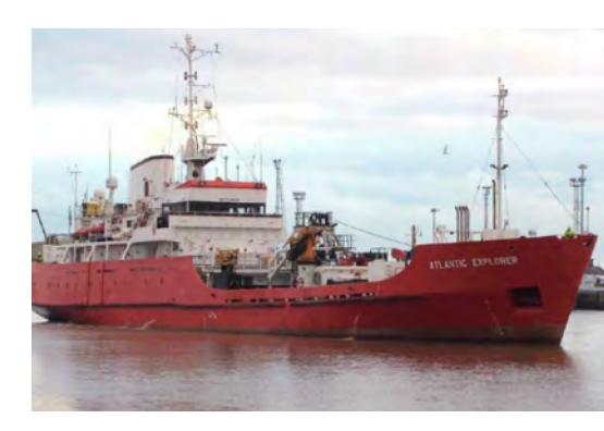
The Atlantic Explorer, a vessel which will be used for boulder clearance.

In November 2017, we contacted mariners in the area to notify them that we are about to commence our works offshore. These works will include: boulder clearance, scour protection and installation of the foundations – all due to begin in December 2017. The teams will start the main works 120 km offshore, which will bring its own challenges.