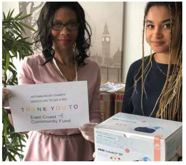
Grant award for our East Coast Community Fund

For further information on our existing funds, including examples of projects we have funded through our CBFs, please refer to our latest newsletter, which can be found at: www.orsted.co.uk/communitybenefitfunds