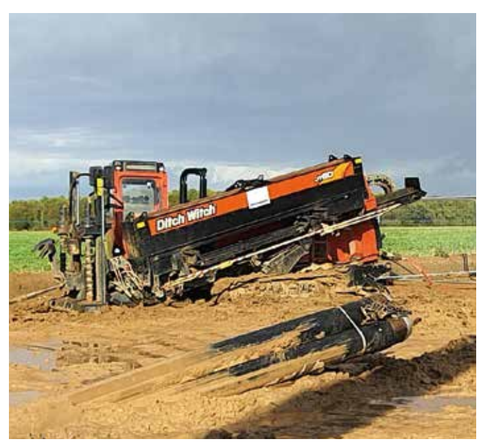
Horizontal Directional Drilling taking place on Hornsea Two

We will continue to keep local communities informed prior to this work being undertaken.