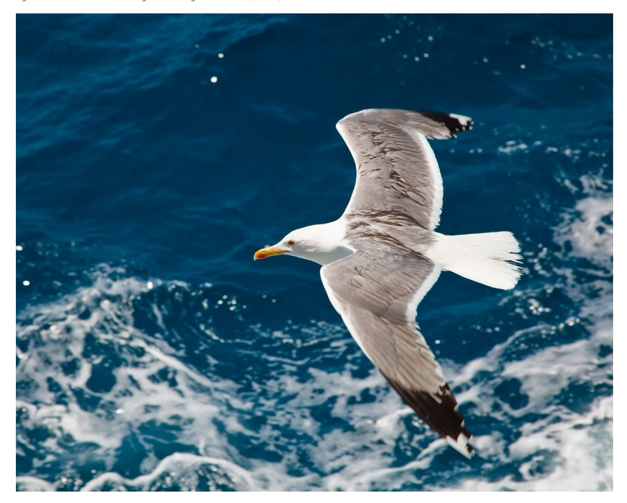
Figure 10.3 Herring Gull, adult (NIRAS)