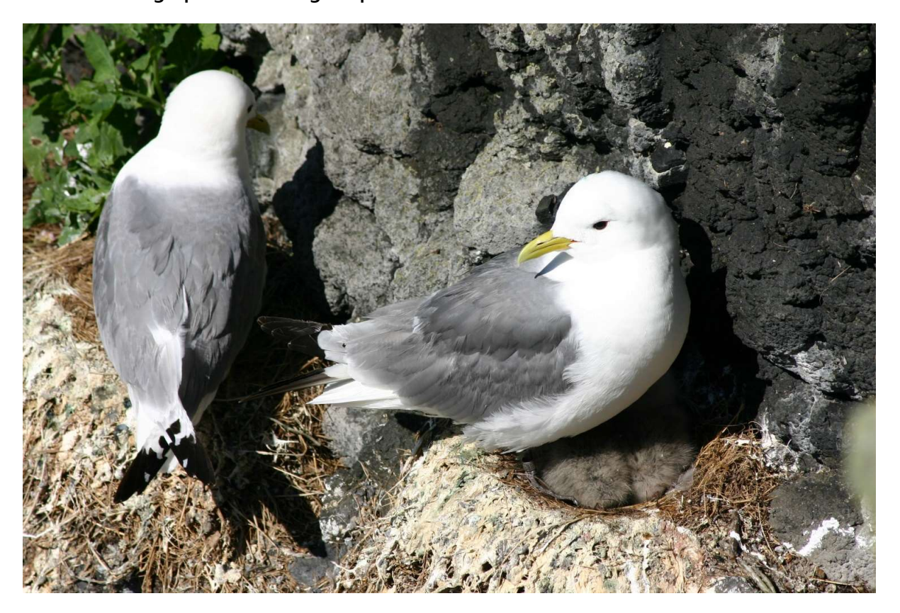
Figure 10.1 Kittiwake, breeding adults at nest (R.M.Ward)