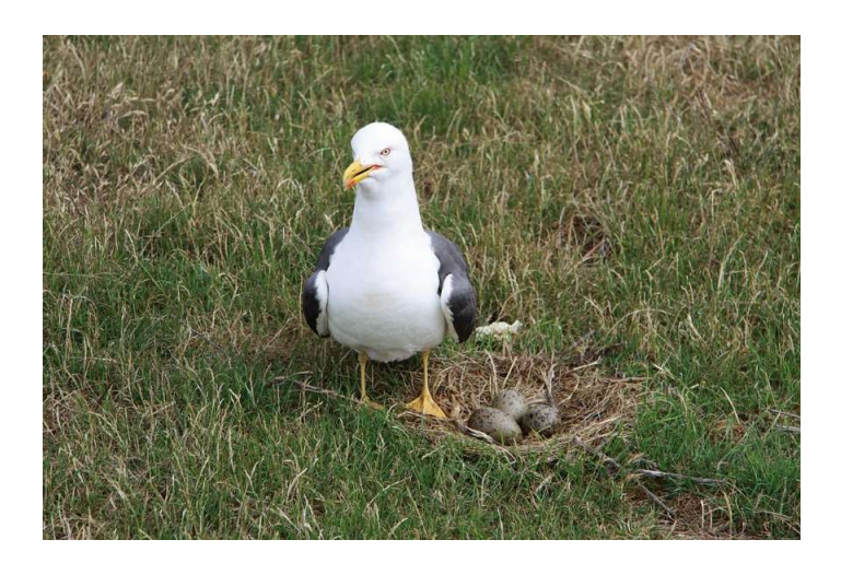
Figure 10.2 Lesser black-backed gull, breeding adult at nest (NIRAS)