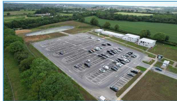
OnCS Car Park

*Please note that these timings are subject to change.