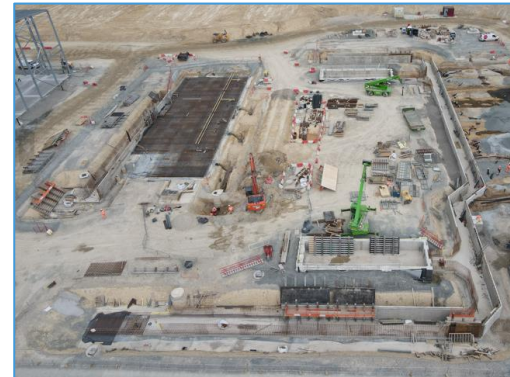
Transformer Yard and Relay Building