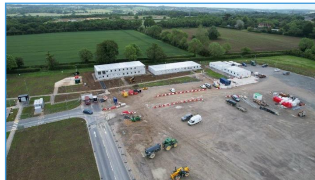
OnCS Machinery Storage Area