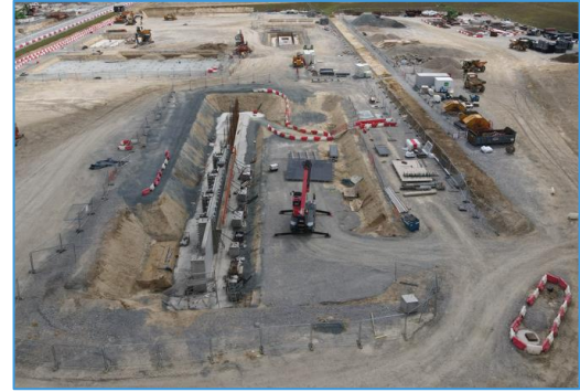
Link 2 Service Building