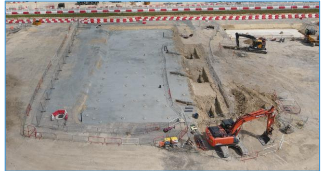
Transformer Yard and Relay Building