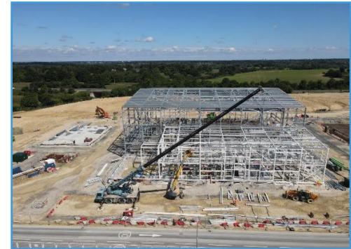
Service Building for Link 1