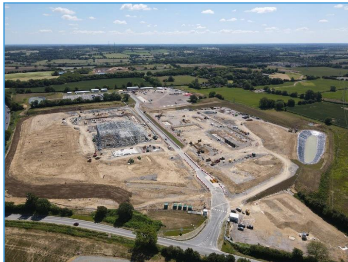
OnCS site entrance as completed

*Please note that these timings are subject to change.