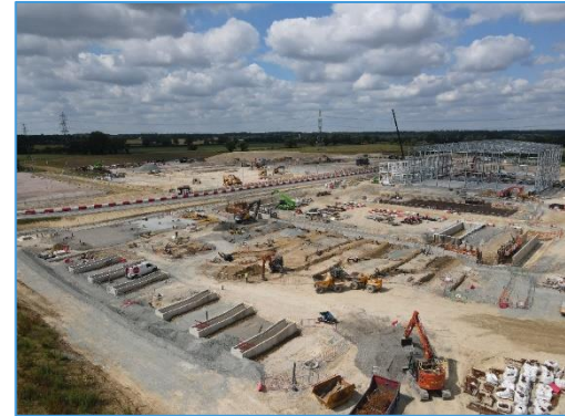
AC Cable Pits and Duct Installation

*Please note that these timings are subject to change.