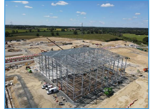
Valve and DC Hall

*Please note that these timings are subject to change.