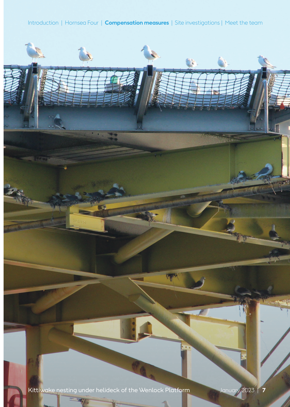
Kittiwake nesting under helideck of the Wenlock Platform

This work builds upon our investigation into bycatch reduction technology, which we held last year. We found a 25% reduction in bycatch of guillemot and razorbill by using the Looming Eyes Buoys. The Looming Eyes Buoys will be used on the vessels until March 2023 and the data from the cameras will then be analysed.