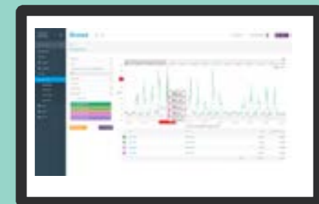
View consumption costs (£) for the previous month