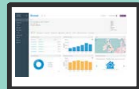
Customisable dashboard gives you the information you need at your fingertips