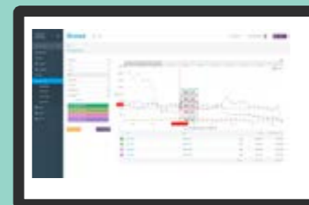
View consumption in kWh for the previous month