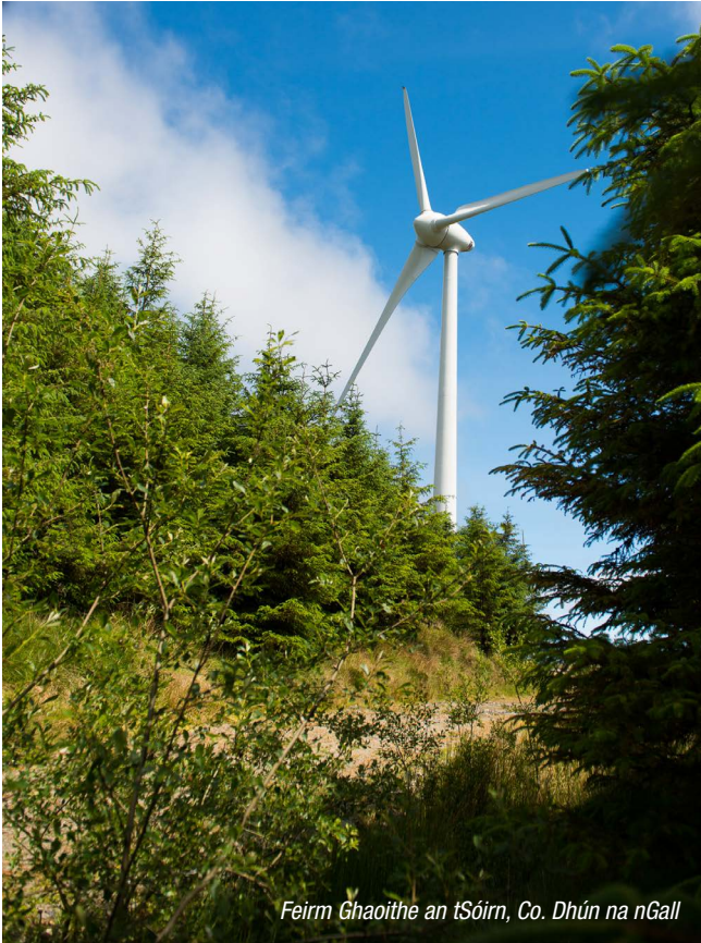
Feirm Ghaoithe an tSóirn, Co. Dhún na nGall