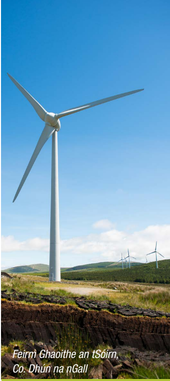
Feirm Ghaoithe an tSóirn, Co. Dhúna na nGal

“Tá na staidéir thimpeallachta á ndéanamh againn go fóill faoi láthair agus ba mhaith linn deimhniú duit go bhfuil muid á ndéanamh de réir na treorach agus na bprótacal COVID-19 ar fad.”