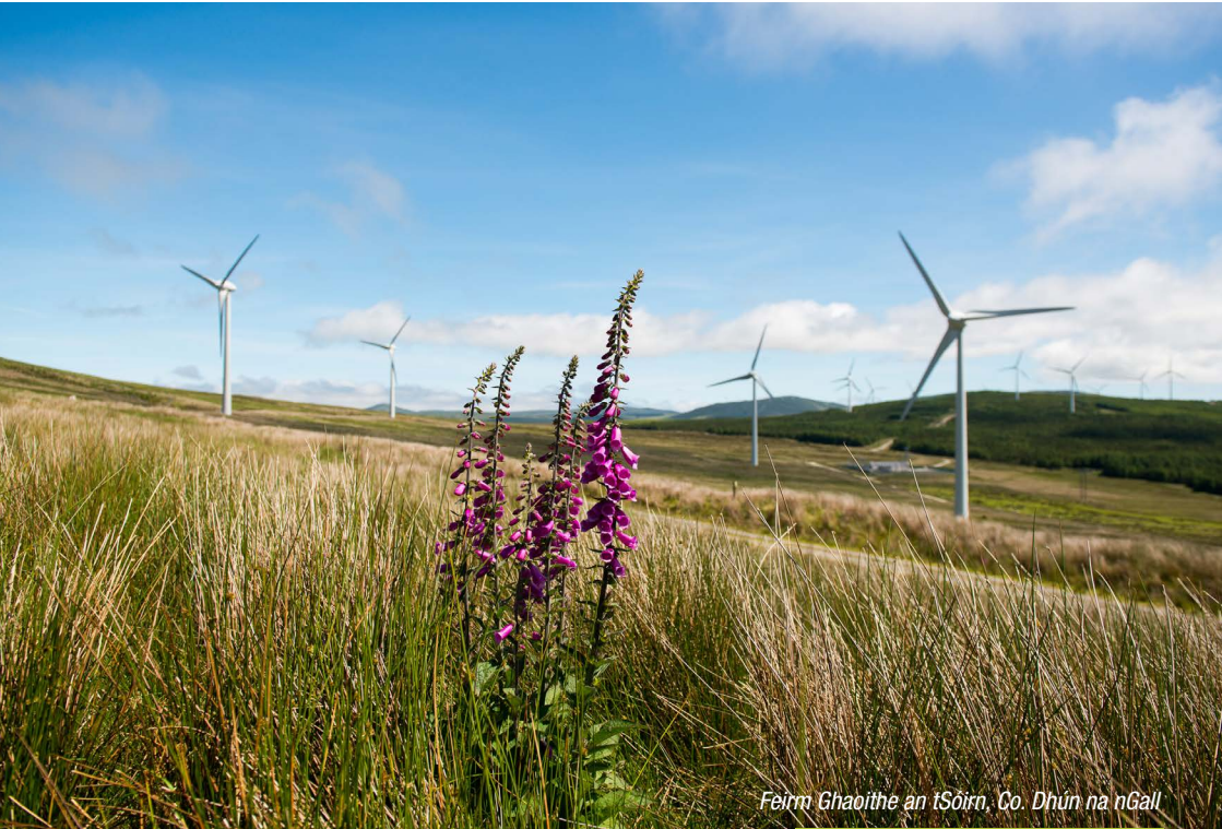
Feirm Ghaoithe an tSóirn, Co. Dhún na nGall