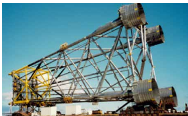
Figure 1: Left, The Sleipner T Statoil platform (installed 1995) and above the Draupner Statoil platform (installed in the Norwegian part of the North Sea 1994)