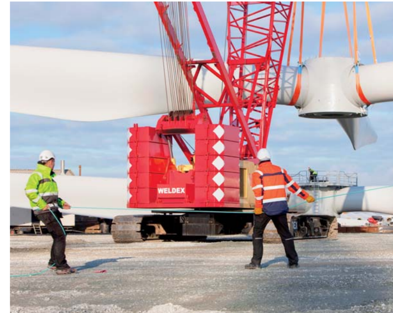
Technicians preparing an offshore wind turbine for installation.

The 91 offshore wind turbines have a total capacity of 209MW and supply renewable energy equivalent to the annual power consumption of 200,000 households.